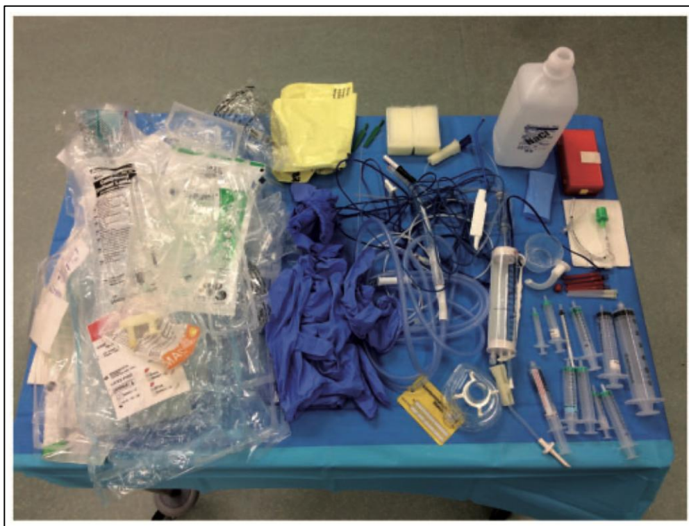
Figure 1. 101 single-use plastic parts in one adenotonsillectomy surgery Source : (Rizan et al., 2020)

Most of this plastic waste is not properly managed, leading to pollution of terrestrial and marine ecosystems. Figure 1.2 shows an example of the number of single-use plastics used in a single adenotonsillectomy (lymph node surgery) operation, which resulted in 101 pieces of plastic. Rizan et al. (2020) note that one of the main ways to dispose of medical plastic waste is through incineration, which produces harmful pollutants such as dioxins and heavy metals, contributing to air pollution and health risks. The burning of medical plastics, especially in facilities that use low technology, often does not fully combust the material, leading to a greater release of pollutants (Rizan et al., 2020). Additionally, medical plastics, such as polypropylene and polyvinyl chloride (PVC) , which are widely used in infusion bags, oxygen cylinders, and other equipment, when burned, release significant carbon emissions. This further exacerbates the negative impact on climate change and public health (Rizan et al., 2020).